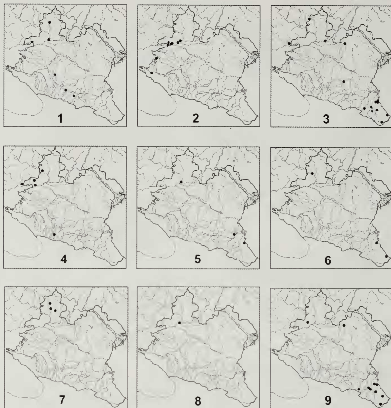
Figs. 1–9. Localities of rare moths in the south of Russia; 1.– Nola cucullatella (Linnaeus, 1758); 2.– Nola chlamitulalis (Hübner, [1813]); 3.– Odice arcuina (Hübner, [1790]); 4.– Macrochilo cribrumalis (Hübner, [1793]); 5.– Zekelita ravalis (Staudinger, 1851); 6.– Schinia cognata (Freyer, 1833); 7.– Victrix umovii (Eversmann, 1846); 8.– Photedes morrisii (Dale, 1837); 9.– Dichagyris vallesiaca (Boisduval, 1837) ssp. subsqualorum Kozhanchikov, 1930.

Nearest localities in the east of Ukraine: 1.– Streletsckaja steppe reserve, 2.– Homutovskaja steppe reserve (Klyuchko et al. 2001).